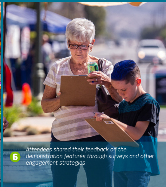
6 Attendees shared their feedback on the demonstration features through surveys and other engagement strategies