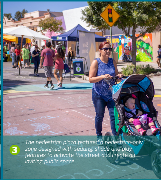
3 The pedestrian plaza featured a pedestrian-only zone designed with seating, shade and play features to activate the street and create an inviting public space.