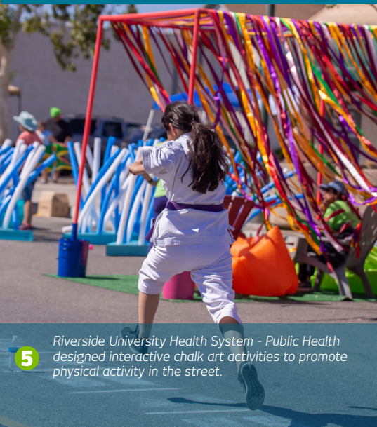
5 Riverside University Health System - Public Health designed interactive chalk art activities to promote physical activity in the street.