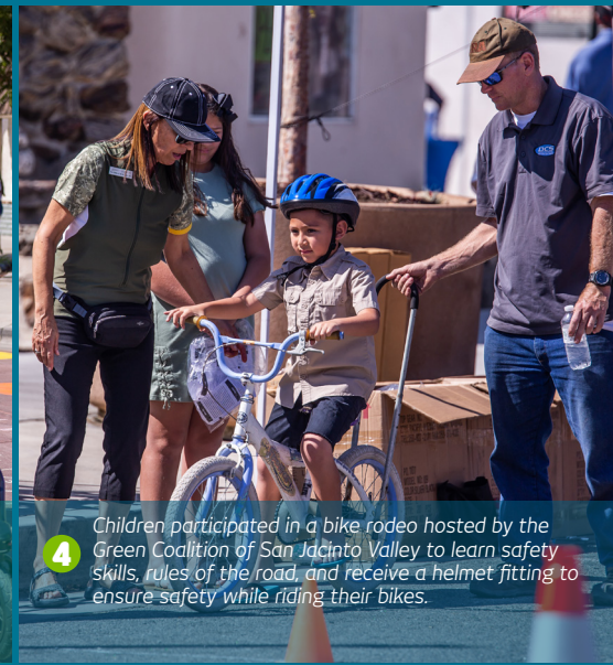
4 Children participated in a bike rodeo hosted by the Green Coalition of San Jacinto Valley to learn safety skills, rules of the road, and receive a helmet fitting to ensure safety while riding their bikes.