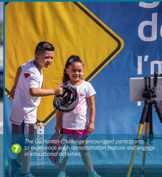
7 The Go Human Challenge encouraged participants to experience each demonstration feature and engage in educational activities.