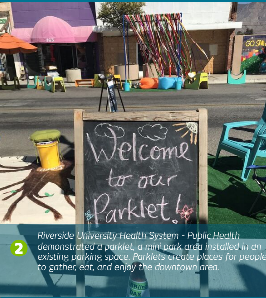
2 Riverside University Health System - Public Health demonstrated a parklet, a mini park area installed in an existing parking space. Parklets create places for people to gather, eat, and enjoy the downtown area.